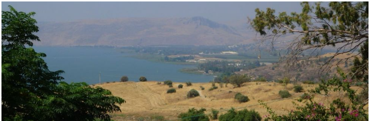
View towards Tiberius from Mt Beatitudes