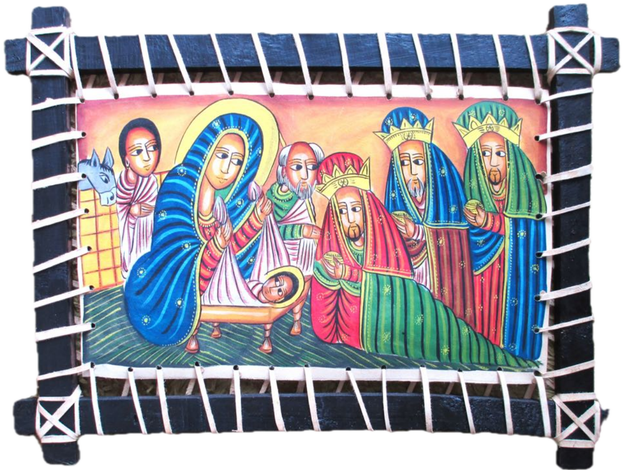
Visit of the Magi. Ethiopian icon. From the collection of the Centre for Coins Culture & Religious History, St John's Cathedral, Brisbane. #3218

The Epiphany of the Lord Jesus 5 January 2025