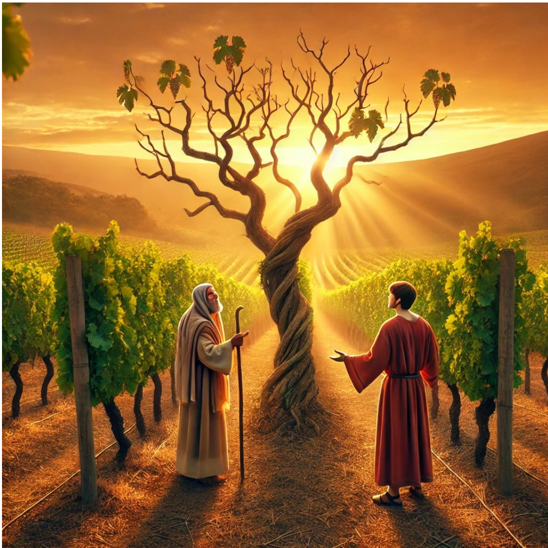
The barren fig tree. AI-generated image